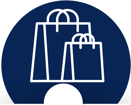
RETAIL & CONSUMER BRANDS