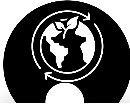
ENVIRONMENTAL & SUSTAINABILITY