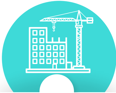
REAL ESATATE & CONSTRUCTION