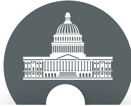
GOVERMENT & SEMI-GOVERMENT