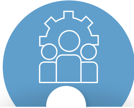
SMEs & FAMILY BUSINESSES